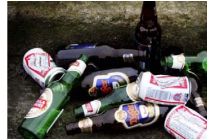
No Loitering and Accumulation of Litter in Front of Store